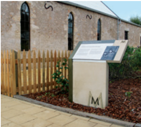
Mary MacKillop Trail Southern Grampians Shire Council

The canonisation of Mary MacKillop was a significant event in 2010. A number of communities in Western Victoria collaborated to plan and implement a touring trail of significant sites in relation to Mary MacKillop's life and work. Challis Design designed and manufactured fourteen interpretive signs that covered Mary MacKillop's early years in Hamilton, Penola, Portland, Robe and Port Macquarie. The signs were manufactured using materials relevant to the region, including basalt in Hamilton and Portland and sandstone in Robe.