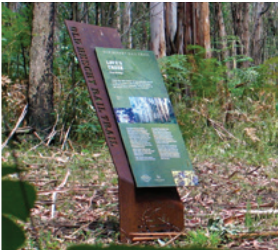
Beechy Rail Trail Colac Otway Shire

2012 – Design, manufacture and installation