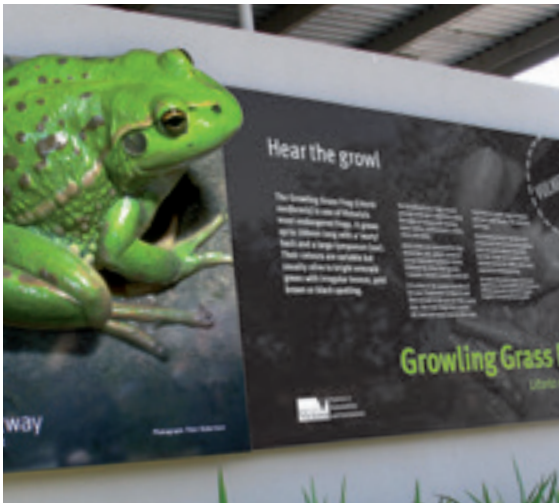
Otway Environmental Signage Colac Otway Shire

2009 – Design, manufacture and installation