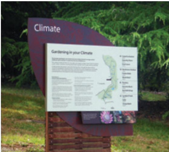
National Rhododendron Gardens Parks Victoria

2010 – Design, Manufacture and Installation